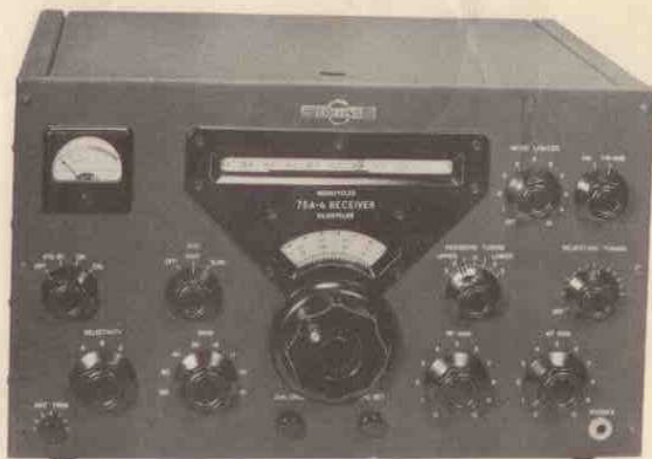
Figure 1. Tuning Knob Mounted on 75A-4 Receiver