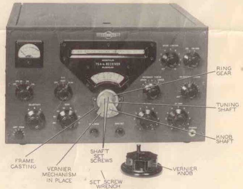
Figure 4. Step 3

6. Release the DIAL DRAG knob. It is no longer used.