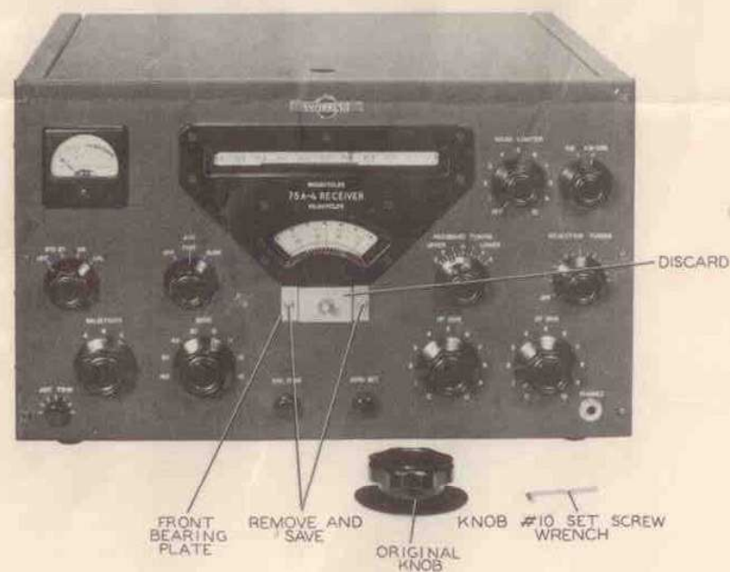
Figure 2. Step 1