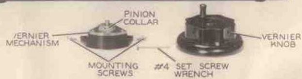
Figure 3. Step 2

3. Figure 3 shows the parts necessary to install the new tuning knob. Arrange these parts as shown and set all others aside.